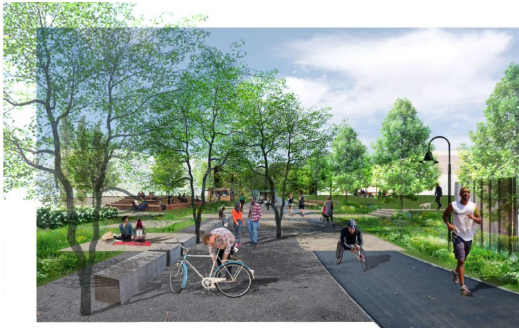
AFTER / FACING EAST TOWARDS AVONDALE