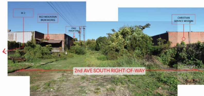
BEFORE / FACING EAST TOWARDS AVONDALE

Once Jones Valley Trail Extension is complete, we anticipate an increase in annual trail users and economic investment along the trail extension. Already, businesses are planning upgrades and beautification projects along their properties in anticipation of the extended trail.