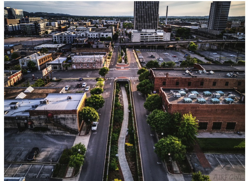
Rotary Trail.